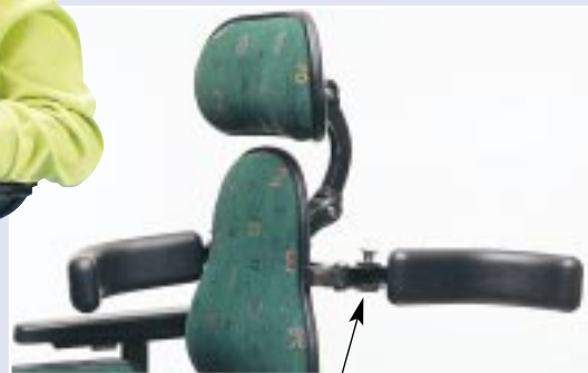
Trunk supports in various sizes are height and width adjustable and have quick-release fastening

The full-featured, user-friendly ABC chair allows therapists and caregivers to seat each special needs child in an appropriate position, enabling the child to better participate in rehabilitation, home or school activities. The ABC Chair can be customized using the