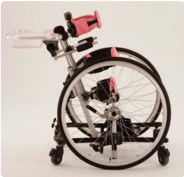
Shown on Mobile Base with Suspension kit, 27" wheels and Transparent Tray.